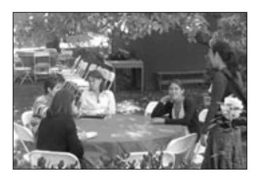
Graduate students, staff, and faculty of the recently created Division of International and Comparative Area Studies mingle at the fall reception on the Bolívar House lawn in October.

The new master's program in Latin American Studies is a year-long 45-unit graduate degree designed for students who have substantial field experience in Latin America but little prior coursework on the region. The purpose of the program is to provide interested students with a foundation in the region by offering a core