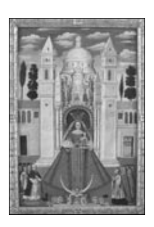
Our Lady of Cayma, ca. 1771-82. Peru, Arequipa. Oil on canvas, 67 x 46-1/2 inches (170.18 x 118.11 cm.)

The most numerous works in the collection are from Cuzco, where native artists broke off from the Spanish guild to form their own organization. They created paintings unique for their willful disregard of European rules of perspective, their disinterest in idealized anatomy, and their generous applications of gold.