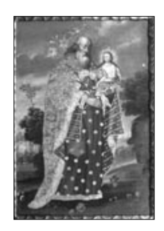
Saint Joachim and the Young Virgin Mary, ca. 1725 or later. Peru, Cuzco, Oil on canvas, 54 x 37-5/16 inches (137.2 x 94.8 cm)